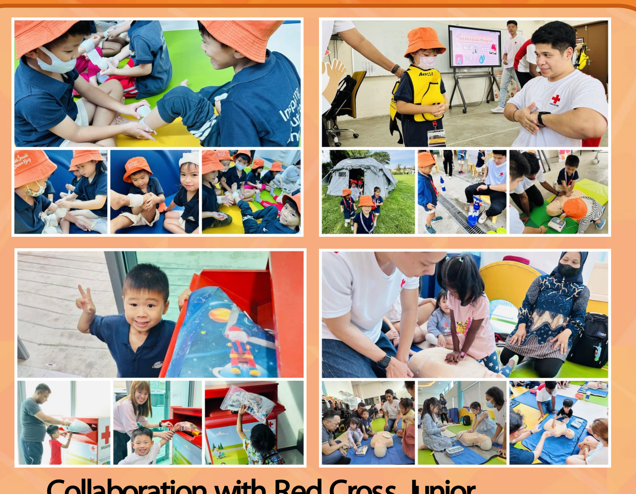
Collaboration with Red Cross Junior