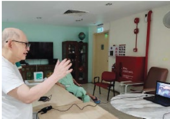
Befriender sessions to engage the Elderly with various activities