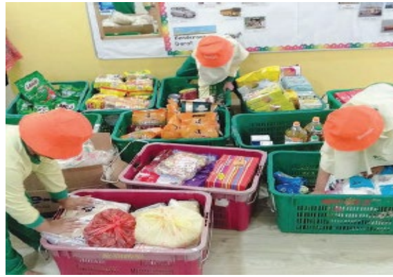
Drop-off groceries or essential items for the less fortunate