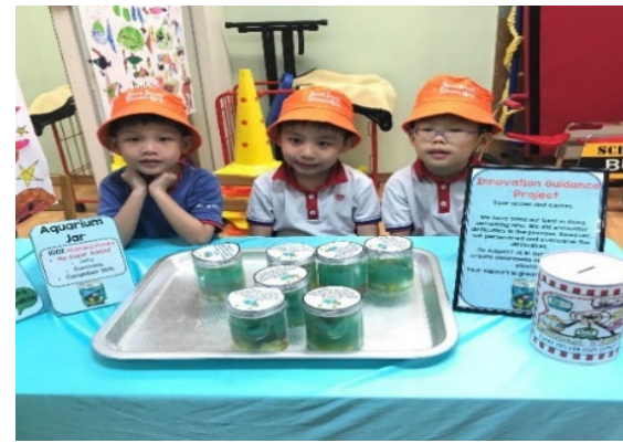
Organise a charity bake & craft sale or sell care packages